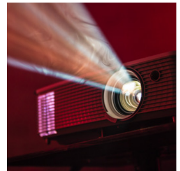
WIRE GRID POLARIZERS